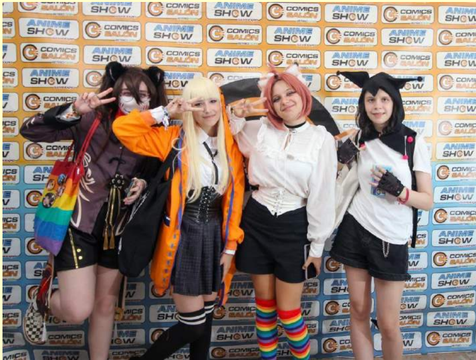
A picture of me and my friends.