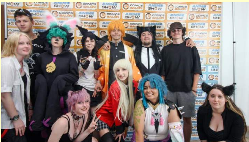
A picture of my friends' group...

It was so sad to go home because I had so much fun that day, but luckily, I will be attending next year Anime Show again! The only thing that is funny is that next year Anime Show is going to be after my important 9th grade test. So, I will be taking my visit to the convention as a reward from the painful upcoming 6 months that I will have to spend on studying for the final test.