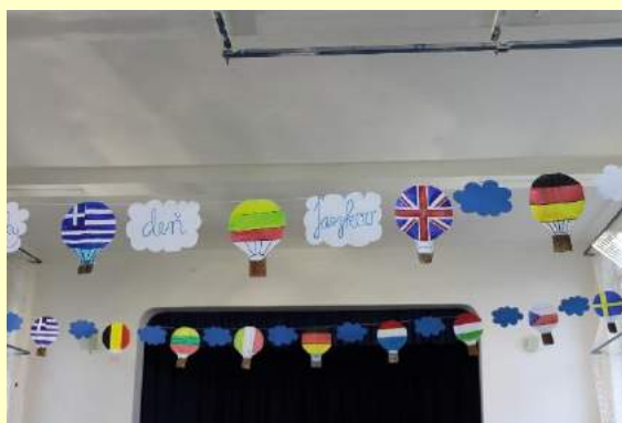
European Day of Languages at Pribinka