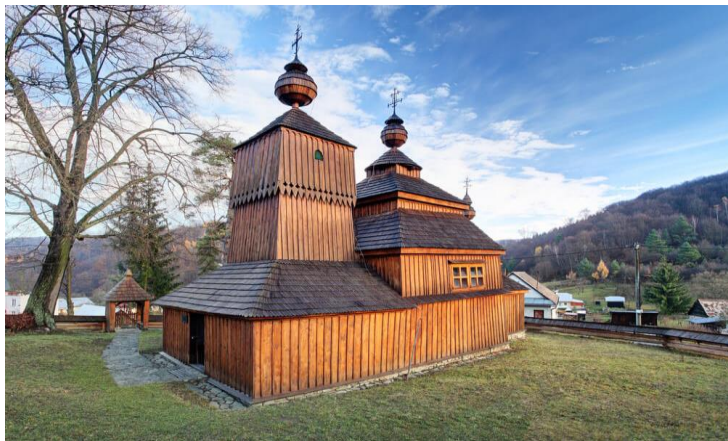
Church in Mirol'a