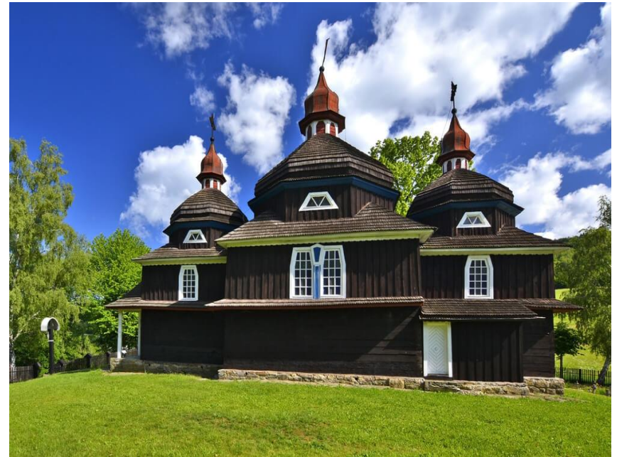
Church in Nižný Komárnik