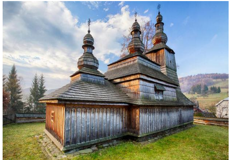
Wooden church in Bodružal