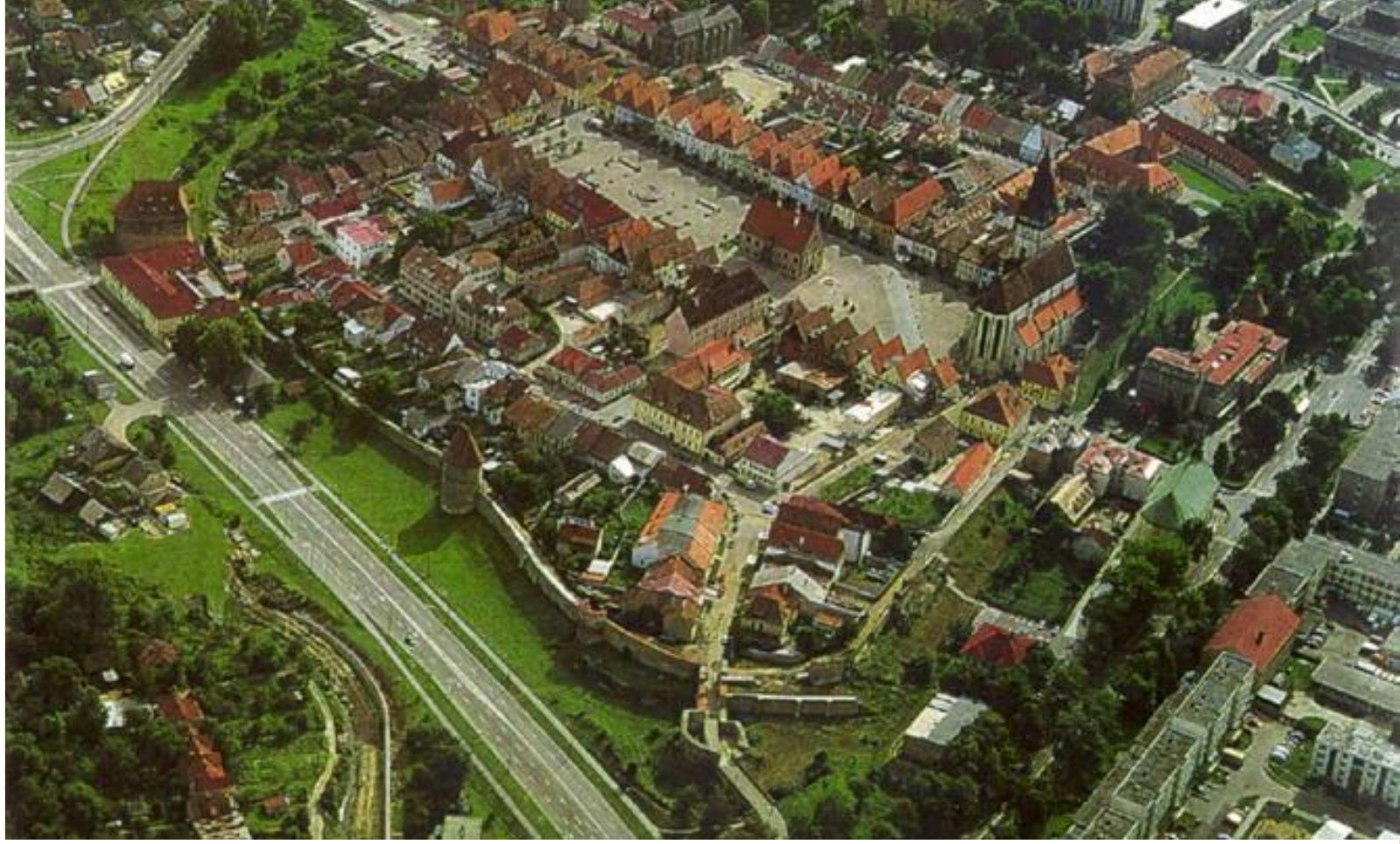
Bardejov town conservation reserve