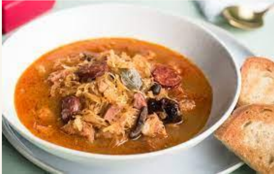
Sauerkraut soup with pork shoulder