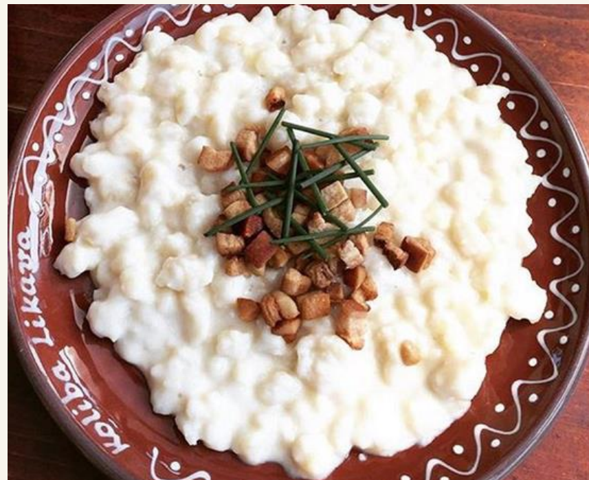
Sheep cheese gnocchi with bacon